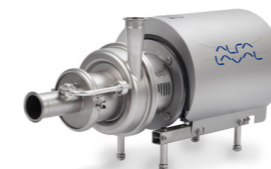
Alfa Laval LKH Prime