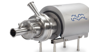
Alfa Laval LKH Prime UltraPure

The latest in Alfa Laval's premium range of best-selling hygienic centrifugal pumps.