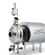
Alfa Laval LKH UltraPure